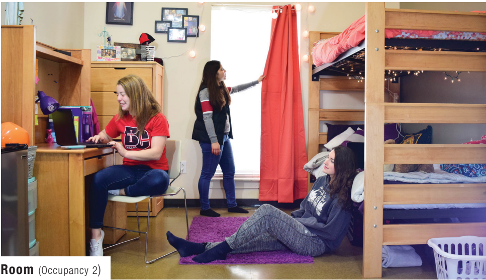
Room (Occupancy 2)