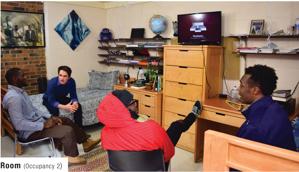
Room (Occupancy 2)