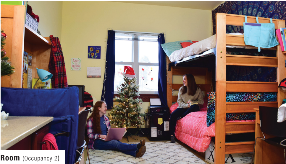
Room (Occupancy 2)